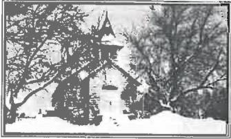
First Home of Trinity Lutheran Church