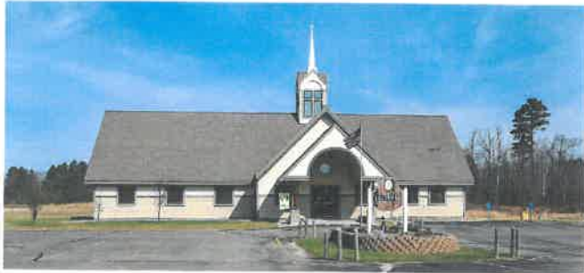
Current Home of Trinity Lutheran Church